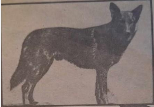
An early example of the breed C. 1900