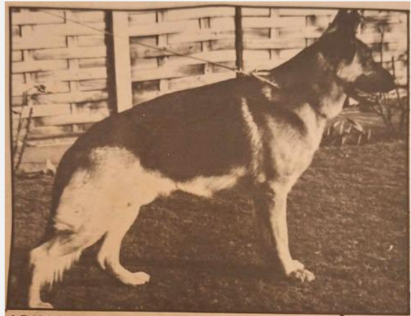
A British-bred champion male of the mid- seventies of 'advanced type for his day'