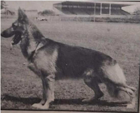
A top winning male of British breeding early seventies

The answer was found in a change of name, and a distortion of the breed's origins: 'Alsatian Wolf Dog'. Such expedient may have enabled the early enthusiasts to 'sell' the dog to the war weary and supposedly 'hun hating' British public.