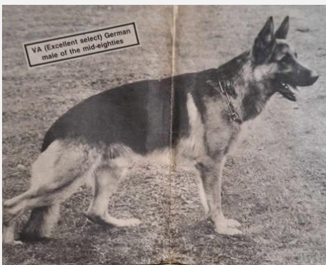
'VA' Excellent Select German male of the mid-eighties

No, they had to come from Germany, and they came in great numbers. Of the 75 Champions made up in Great Britain up to 1930, a total of 31 were bred in Germany. This figure does not include champions from imported parents. Many more German imports gained one or two challenge certificates during this period.