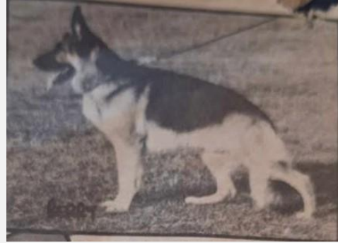
A British bred champion male of the eighties

Most people in German Shepherds, and, indeed, many in canine circles beyond the boundaries of the GSD world are aware that in the United Kingdom at least, there are two types of German Shepherd being bred and shown. Why is this, and how has it come about?